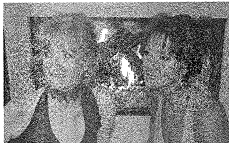
( http://media.cleveland.com/north-royalton/photo/coso-sistersjpg-99a5566656778d13.jpg )